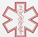
First Aid Supplies